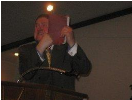
Jesus is same yesterday, today, and forever. The technology changes lots. His Word never changes.