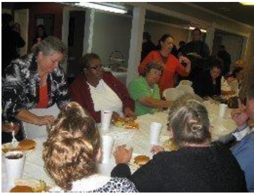
The happy fellowship