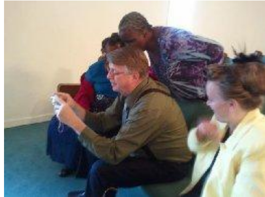
We watched video of baptism on digital camera