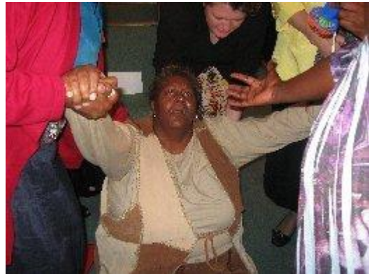
Mary focus on only Him!