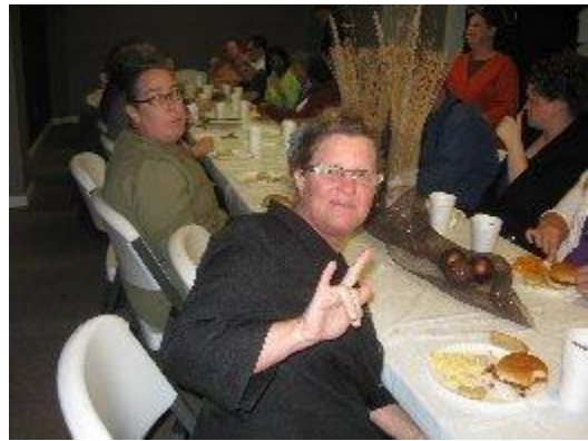
Is it funny about Luther's swollen cheek?