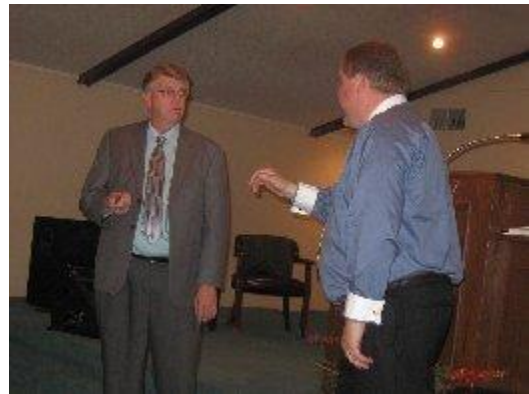
The video will display in Part 3