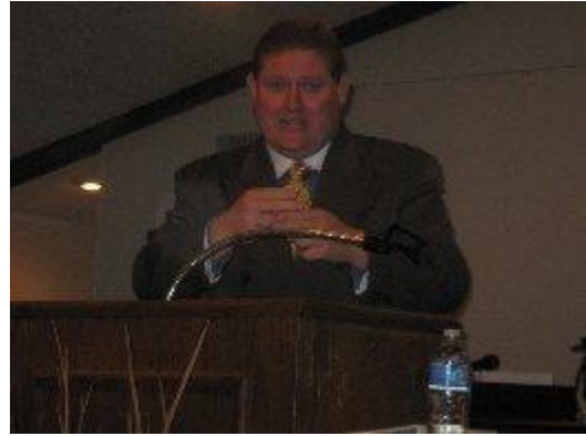
The people repeat same circle of their habits. They must lift the level to change habits