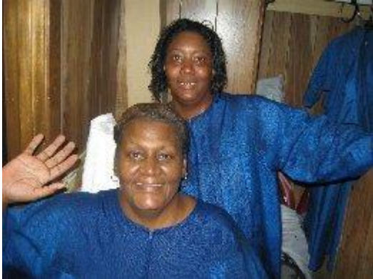
They had full smiles!